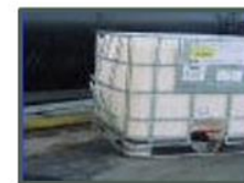
Damaged Cage and/or Pallet