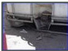
Damaged Corner Piece