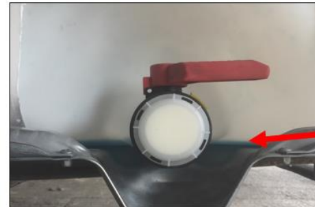
0.8 gallon, below the valve